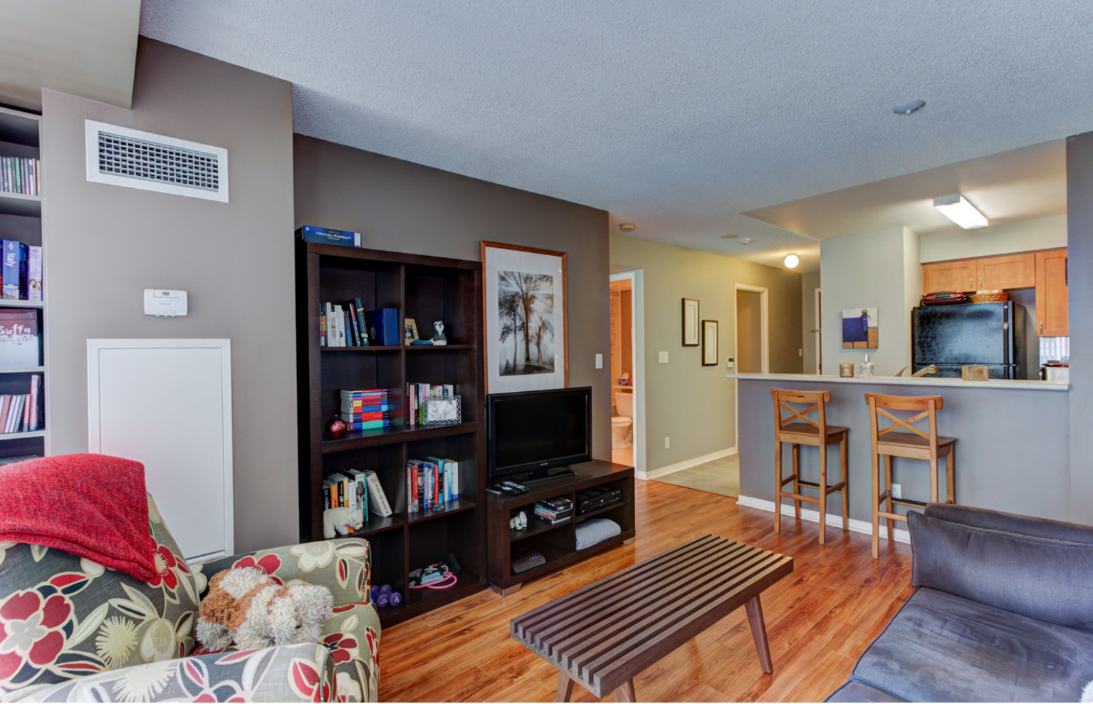
7 MICHAEL POWER PLACE SUITE 1204 SAGE

No BS. No Fridge Magnets. No Broken Promises.