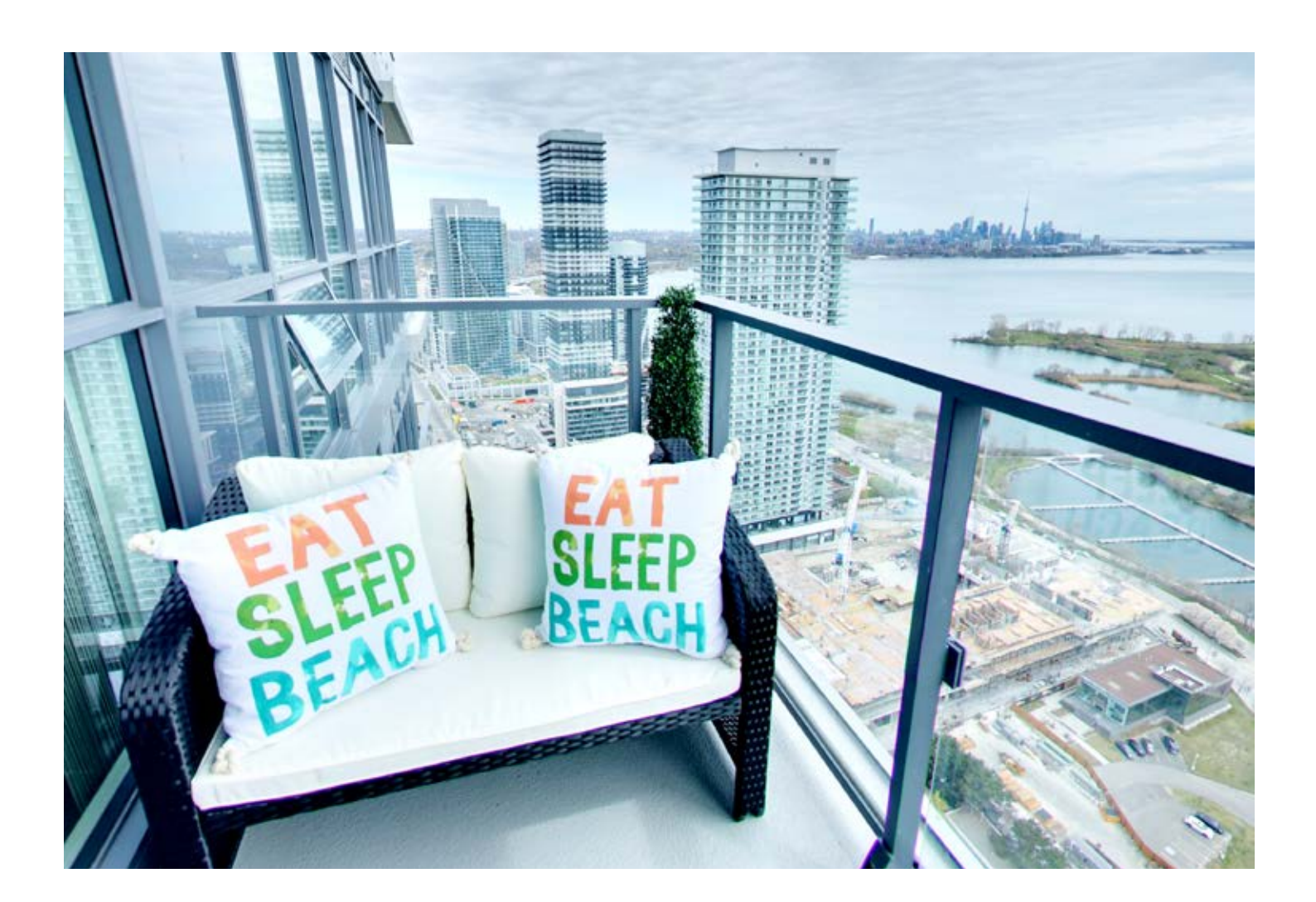
2200 LAKE SHORE BOULEVARD WEST SUITE 4510

Sage Real Estate Ltd., Brokerage 3091 Dundas Street West, Toronto, ON T 416.483.8000 F 416.483.8001 Information and statements contained herein are from sources deemed to be reliable and assumed to be correct but no warranty or representations are made as to the accuracy thereof and same is subject to errors or omissions. This brochure is not intended to solicit Sellers or Buyers currently under contract with another brokerage. Designed and printed by Sage Real Estate. SageRealEstate.ca