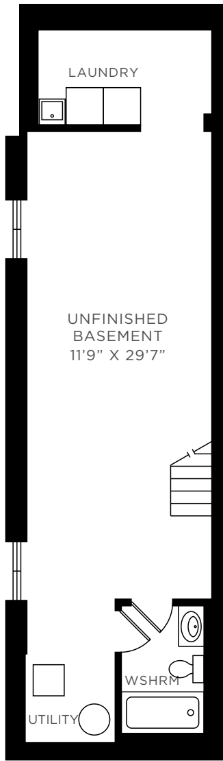
LOWER LEVEL 633 SQUARE FEET BELOW GRADE