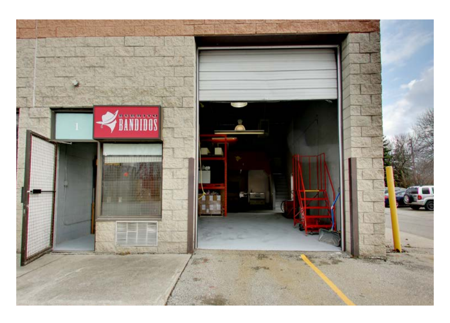
1095 STRATHY AVENUE UNIT 1 SAGE